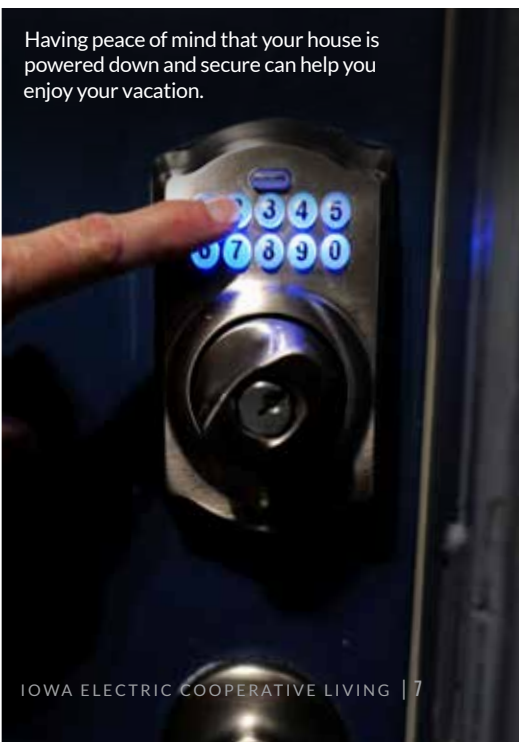
Having peace of mind that your house is powered down and secure can help you enjoy your vacation.