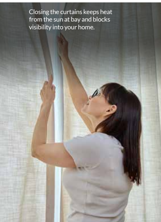
Closing the curtains keeps heat from the sun at bay and blocks visibility into your home.