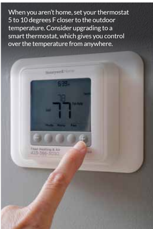
When you aren't home, set your thermostat 5 to 10 degrees F closer to the outdoor temperature. Consider upgrading to a smart thermostat, which gives you control over the temperature from anywhere.